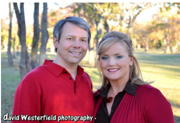
David Westerfield photography